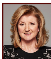
Ariana Huffington Founder & CEO Thrive Global