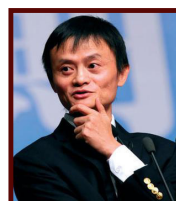
Jack Ma Founder, Chairman Alibaba