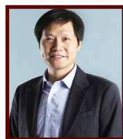
Lei Jun Founder, Chairman & CEO, Xiaomi