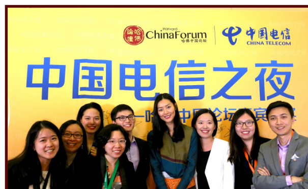
China Telecom, HCCF 2016 Honorary Sponsor, with speaker and supermodel, Liu Wen