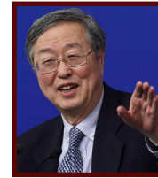
Zhou Xiaochuan Governor People's Bank of China