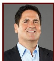
Mark Cuban Entrepreneur; Owner, the NBA's Dallas Mavericks