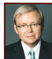
Kevin Rudd Former Prime Minister of Australia