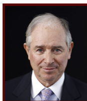
Stephen Schwarzman Co-founder Blackrock, Inc