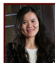
Lucy Peng Lei Co-Founder Alibaba. Ant Financial