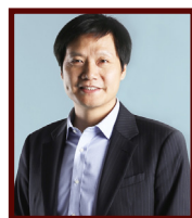
Lei Jun Founder, Chairman & CEO, Xiaomi