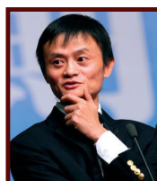
Jack Ma Founder, Chairman Alibaba