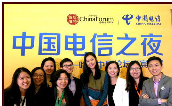
China Telecom, HCCF 2016 Honorary Sponsor, with speaker and supermodel, Liu Wen