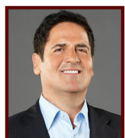
Mark Cuban Entrepreneur; Owner, the NBA's Dallas Mavericks