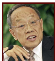
Li Zhaoxing Former Chinese Minis- ter of Foreign Affairs