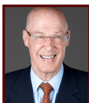
Hank Paulson Former U.S. Secretary of the Treasury